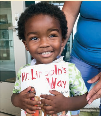
Preschooler adores the book he chose at a meal distribution site

This holiday season, please consider a gift to support our work.