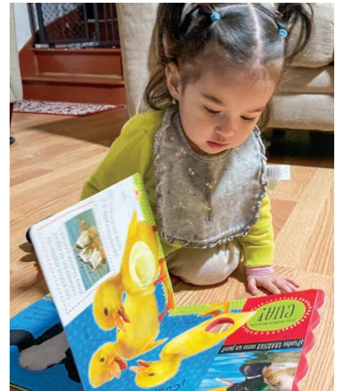
A child enrolled in Early Steps explores a new book.

There on the page was today's reminder of how transformational the act of sharing stories and listening to stories can be in our lives. Whether we are sharing the stories of our ancestors, or the stories of our present, whether we're sitting with our elders or have