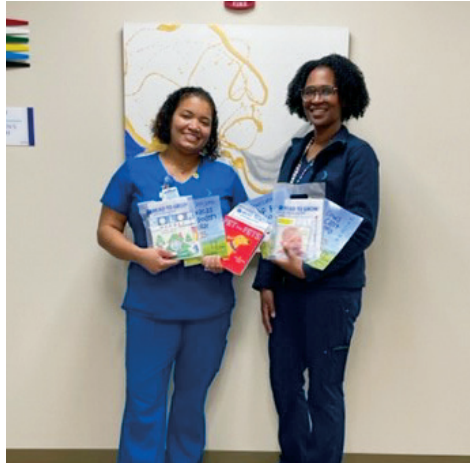
Cornell Scott medical providers proudly display prenatal packets from Read to Grow

We value the Read to Grow program as it highlights the importance of parents and caregivers reading to babies, even in pregnancy. At approximately 5 months of pregnancy, babies can start hearing their first sounds and recognizing voices. Talking and reading to babies during the prenatal period increases bonding and helps with babies' brain development. The more we read to babies the