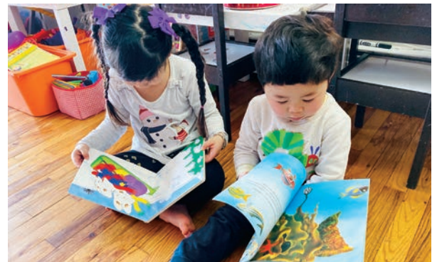
A Branford area family enjoys Read to Grow books they picked up at Read to Grow's curbside pick-up option.

nearly 3,100 books made their way across Connecticut through book requests in 2020. In 2021, 5,729 books went out. In addition, we also made our Branford warehouse a curbside pickup option for book requests. With the assistance of our dedicated volunteers, the Books for Kids coordinators sent envelopes and boxes of books to children in cities and towns all over the state. Families from down the road in Branford came often, but we also saw folks from as far as Norwalk making the trip to School Ground Road.