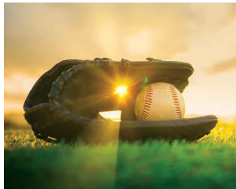
Join us in Hartford on May 20.

excited to announce our Make a Play for Literacy fundraiser at Dunkin Donuts Park (aka Yard Goats Stadium) in Hartford on May 20! Tickets for this unique event include a